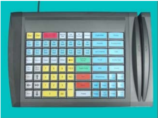
(a) An alterntive keyboard