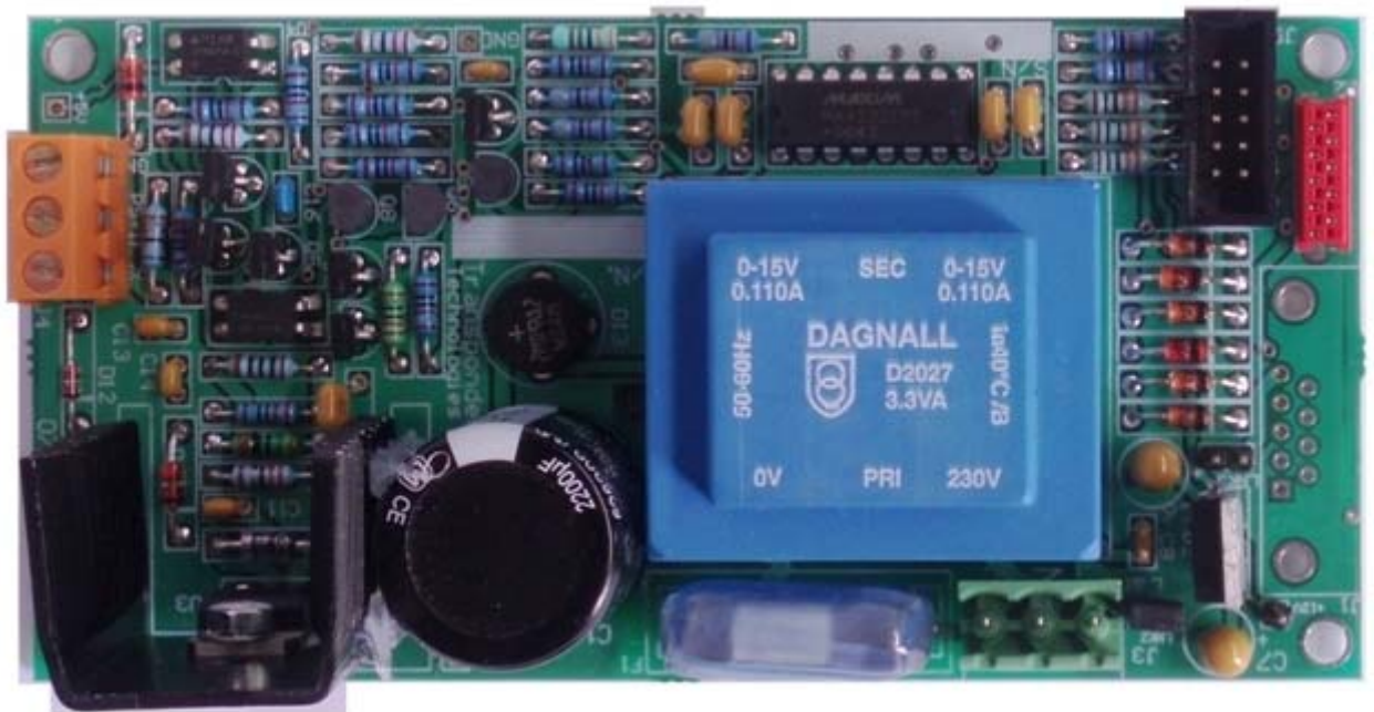
(b) Transponder Technologies Gilbarco Protocol Communication Converter