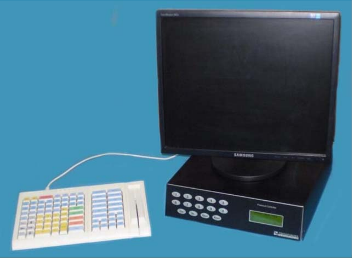
Transponder Technologies Model TransTech FC6000 Control System